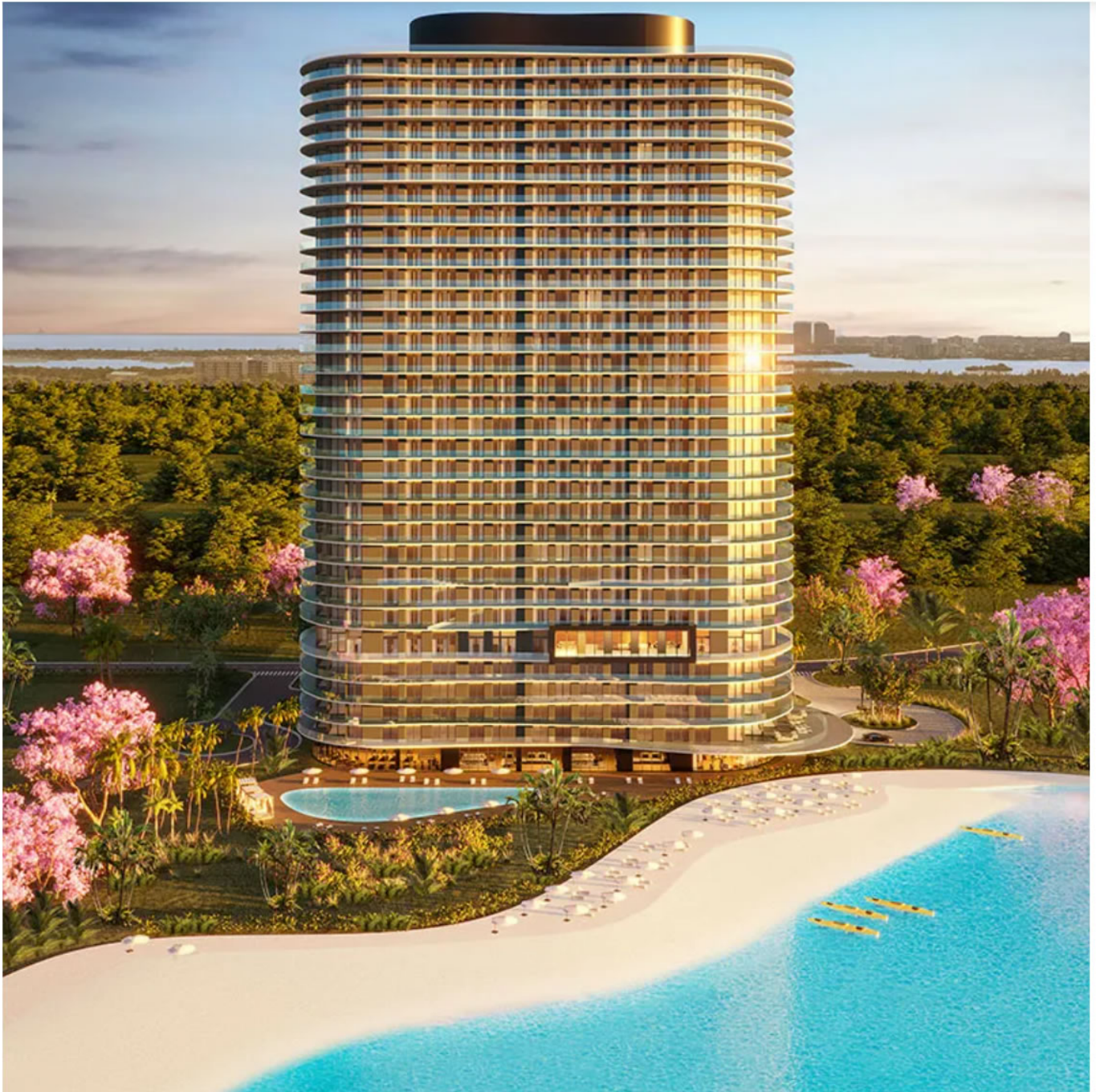
Crystal Lagoons' design adjacent to ONE Park Tower by Turnberry