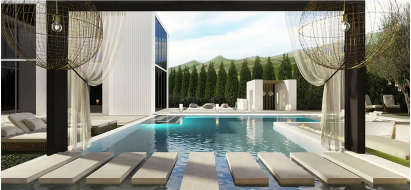
Outdoor living space by Foxterra Design

this organic modern style continues to set the standard. What has been in vogue on the West Coast is now gaining interest from developers and designers all over.”